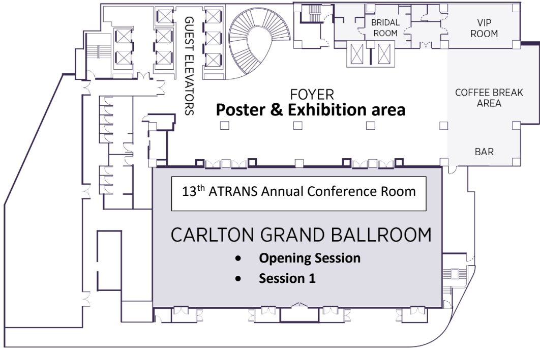
Afternoon Floor Plan